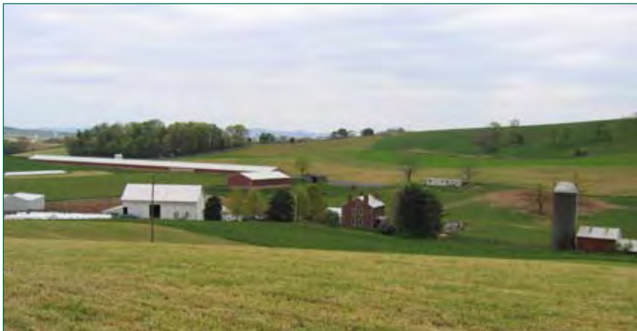
Working agricultural lands often include larger buildings, like this historic farm with both cattle and poultry operations in western Rockingham County.

another 400,000 acres of land—a mark Governor Kaine had managed to meet during better economic times. The Governor is looking to working farm and forest landowners to help reach this ambitious goal.