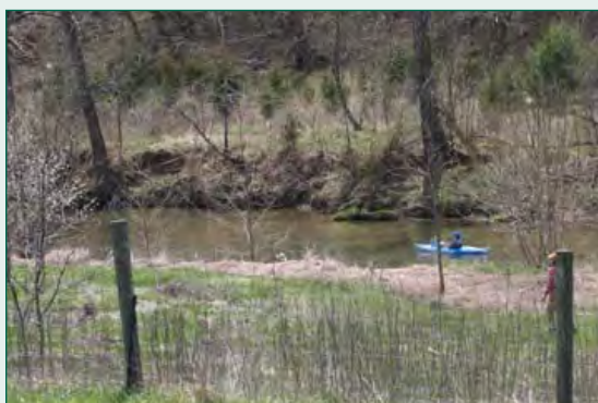
A kayaker floats the Middle River in Augusta. A new easement protects an additional 1.6 miles of streambank.

VCC staff took the photos below in early April while monitoring conservation easements in Augusta County. These healthy streams support people, plants and animals.