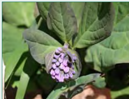
Blue Bells about to fully open