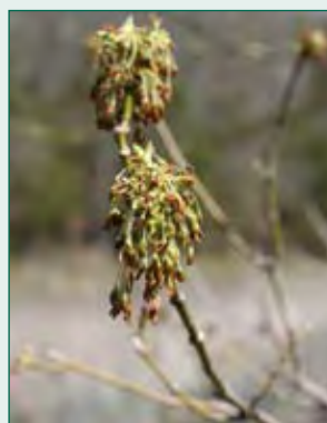
Box elder tree blossom