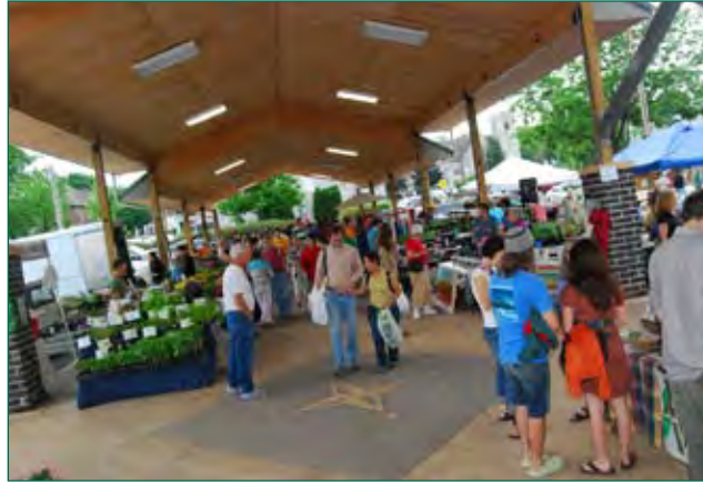
Harrisonburg Farmers Market

About 120 Valley farmers, restaurant owners, chefs, school food coordinators, community gardening advocates, marketers, students, extension agents, and other concerned professionals and citizens gathered, shared success