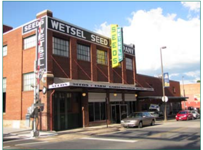
Wetsel Building, Harrisonburg, is now filled with offices, shops and a restaurant.

When Marvin and Robin Baker took on the rehabilitation of the 1935 landmark Wetsel Seed Building on West Market Street in Harrisonburg, they wanted to recapture the vibrancy the area had in past generations. They certainly have. The mixed-use space includes office, retail, and a thriving restaurant. The new Wetsel Complex pays full homage to the old, including keeping the Wetsel signs, retaining historic features, and weaving historic displays into the restaurant décor. The upper floor serves as offices for Rosetta Stone and new retail businesses have opened on the first floor. Together the restaurant, offices, and stores have close to 100 employees. This combination puts the block squarely back in the positive column. The entire family shared in the project research, design and implementation.