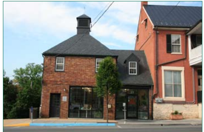
Fire House Gallery and Shop, Town of Berryville

The Town of Berryville and Berryville Main Street (BMS) were honored for a partnership that turned the former fire house and town hall into a beacon of cultural activity downtown. The town and Clarke County helped fund renovations and BMS raised the rest in donations and in-kind gifts. The building was cleverly and sensitively designed into an airy art gallery with space for BMS offices and a small business incubator. The Gallery has sparked programs, created jobs, and helps support local artists. The design was done by Berryville’s own Main Street Architecture.