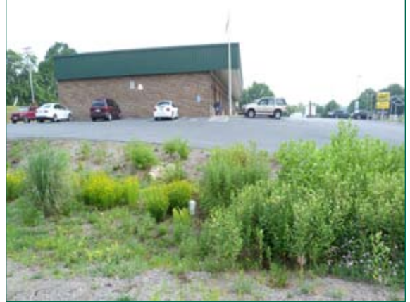
Before and after: Greenville Mini-mall Bioretention Basin, Augusta County