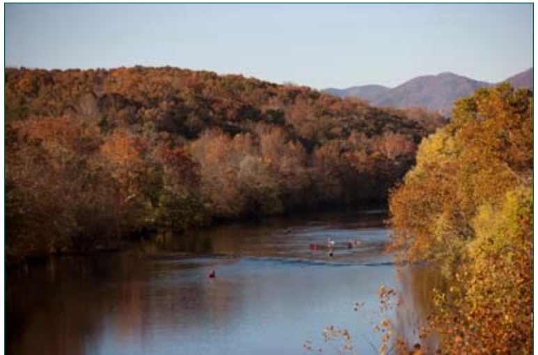
Upper James River Trail, Botetourt County

Alleghany and Blue Ridge Mountains, farm land, and wildlife. The project focused on increasing access to the river while also preserving its natural state. Website, brochures, and the signs at each access point help visitors learn more about the ecological importance of the watershed. The project is managed by the Botetourt County Office of Tourism and can be seen at www.upperjamesriverwatertrail.com .