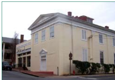
Troubadour Theater Building