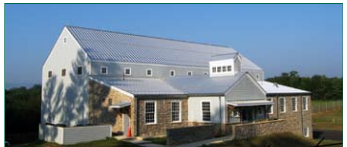
Coyner Springs Water Treatment Plant, Waynesboro

Coyner Springs holds a special place in the hearts of many in the Waynesboro area. Its historic rock-lined water channels and picnic shelters have been a favored recreation spot for generations. The challenge of creating a new water treatment facility at this site was taken as an opportunity to respect local character in new construction and to demonstrate that infrastructure projects can be both functional and very attractive. The City of Waynesboro designed a building that fits the Coyner Springs’ park setting. The design team embraced a barn style and natural materials that complement the beauty of the area and local architectural traditions.