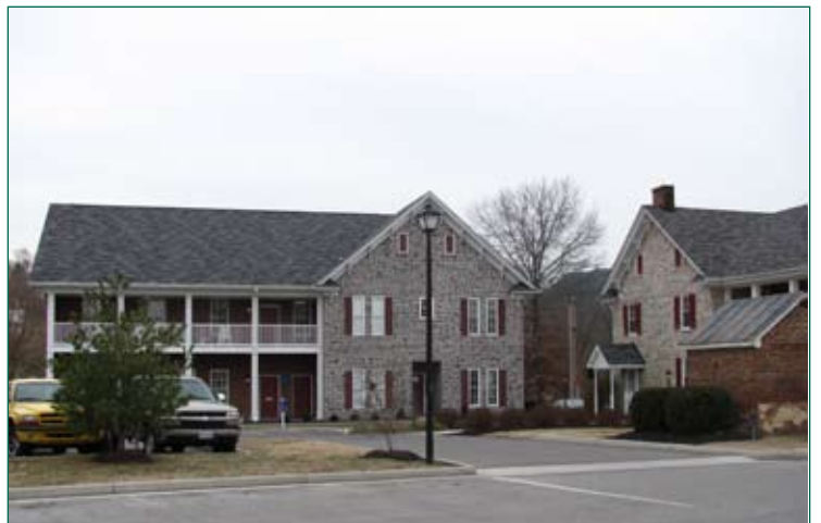
Bank of Fincastle’s new building (left) and restored building (right) in Daleville

The attractive pair of limestone buildings on Roanoke Road in Daleville exemplifies the best of historic preservation and compatible new development. The community can thank the Bank of Fincastle for restoring a historic building in a very visible location on Route 220 and designing a new building to be its perfect complement. Traditional materials and architectural features and a connecting walk help integrate the two buildings. Parking was sited to avoid cluttering the view from the front. “Our goal was to continue the integrity and structure of the old building. We wanted them to look like they had been there together for many years,” explained the bank’s Mary Ann Layman. The result is an investment not only in commerce but also in local character and history. Architect Anthony Veloso designed the new stone building while Gluth Construction was the contractor for the rehabilitated building. Both buildings are rented to tenants.