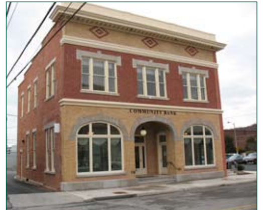
Before and After: Peoples Bank (now Community Bank), Buena Vista