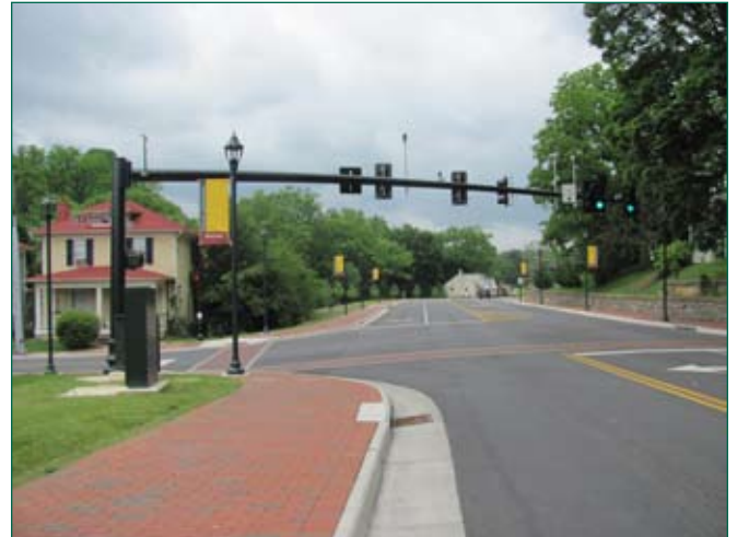
Churchville Avenue, Staunton

When Churchville Avenue, the narrow thoroughfare connecting downtown Staunton to the park and parts west, was widened for several blocks to add turn lanes, the city also designed the strip to be beautiful and pedestrian friendly. A lovely boulevard with brick crosswalks and sidewalks, street trees, and dark-sky friendly street lights provides an attractive and functional gateway to historic downtown. Shade trees were planted on the length adjacent to Peyton Creek while sidewalks were restored on the north side. This increasingly traveled pedestrian corridor extends out of downtown to key destinations. It also is largely residential, so the city specified full-cutoff light fixtures with lower intensity and even light distribution. The difference is striking at night. Staunton laid out strong pedestrian, aesthetic, and environmental goals and VDOT’s Staunton Region Design Unit responded to the challenge.