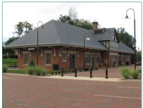
Luray Depot, Town of Luray

The rehabilitation of the historic Luray Train Depot caps a 10-year effort by local officials and citizens, especially the Luray Train Club. The depot had sat vacant since the 1950s but now is restored inside and out with enhanced parking and landscaped areas. Today the beautifully restored Luray Train Depot serves as administrative offices for the Page/Luray Chamber of Commerce and is home to a local railroad museum. The depot is connected to the Town’s greenway with its bicycle and walking paths; a concealed on-site stormwater retention system using a permeable brick paver system ensures no stormwater leaves the site; and the plaza provides a public gathering space. Unflagging community participation—fund raising, promotion, and donations of materials, labor, and expertise—was a great part of the project’s success.