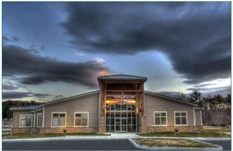
Eagle Rock Library, Botetourt County