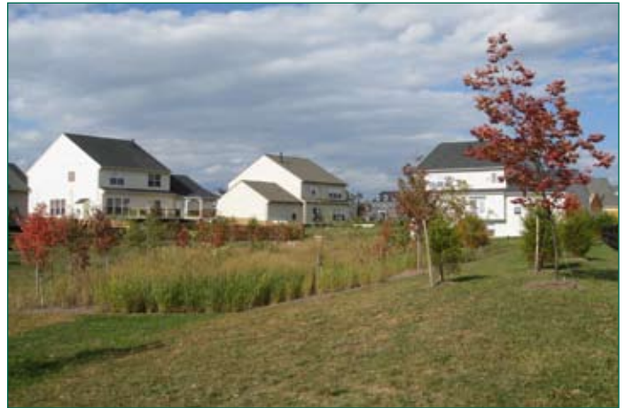
Meadow View subdivision in the Town of Boyce

Meadow View adds 41 lots in a textbook example of a neotraditional street, parcel, and house arrangement with a central village green. A large rain garden also serves as an attractive feature for the entire community. Roseville Downs’ neotraditional parcel and house arrangement also includes extensive common open space as well as rain gardens. Boyce Crossing has a four-acre grove of mature oak trees at its entrance. A park for residents has been completed and a future section will feature alleyways.