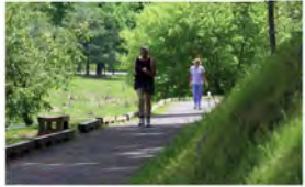
Meeting 21st Century Challenges