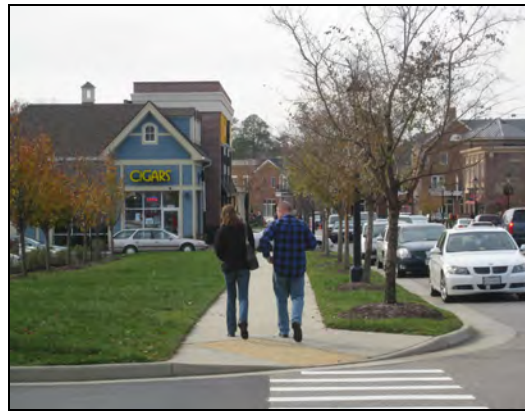
Build vibrant neighborhoods