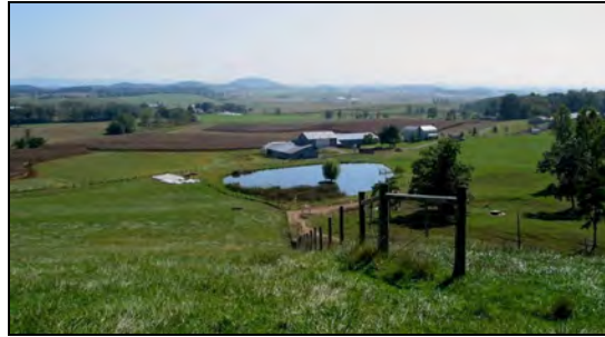
Conserve working landscapes